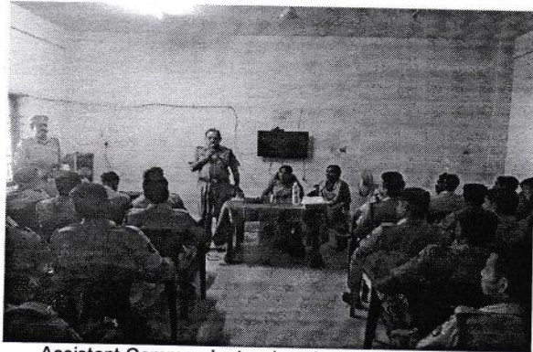
Assistant Commandant welcoming and giving a brief Introduction to the participants about the Awareness programme