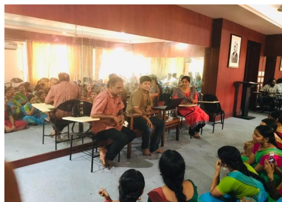
Interaction session during the IGNOU programme