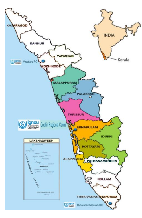
(Fig-1: Map showing the jurisdiction of IGNOU Regional Centre, Cochin)

With the establishment of Regional Centre, Trivandrum in the year 2009, jurisdiction of three southern districts of the State viz., Kollam, Pathanamthitta and Thriuvananthapuram districts have been allotted to the Regional Centre, Trivandrum. Later, in 2011, another Regional Centre was established at Vatakara in Kozhikode district, with the jurisdiction of four northern districts such as Kasaragod, Kannur, Kozhikode and Wayanad. Now, the Regional Centre, Cochin caters to seven districts of Kerala viz., Ernakulam, Malappuram, Palakkad, Kottayam, Idukki and Alappuzha. In addition, the Union Territory of Lakshadweep also comes under the jurisdiction of RC, Cochin (Fig:1).