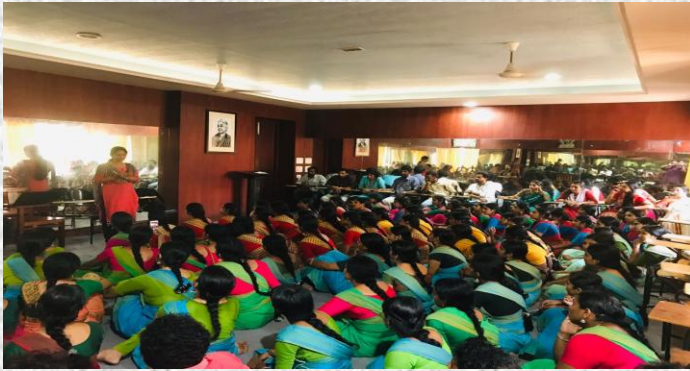
Admission promotion amongst college students of RLV College of Music and Fine Arts, Tripunithura on 5 th Dec 2018