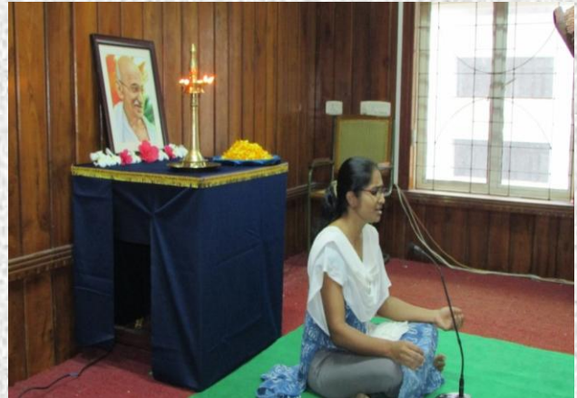
Bhajan recital during the Celebrations