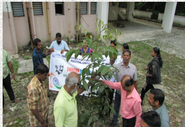
Planting of Tree saplings by RC and REC staff at RC Campus as part of the celebration