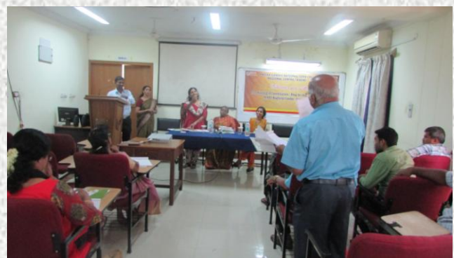
Reflections from Coordinator, SC 1402