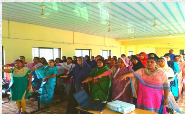
Panchayat and Kudumbashree members taking Vigilance pledge at Edathala Gram Panchayat on 29 th Oct 2019

As part of UBA activities for Chendamangalam village, IGNOU Awareness programmes were organised on 20 Dec 2018 for two Handloom Societies, the Bachelors, Masters and Certificate programmes were highlighted with a view to