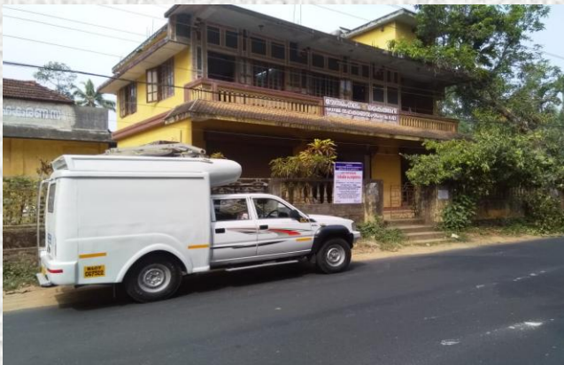
MeLT Van at venue of UBA programme at Chendamangalam on 20 th December 2018