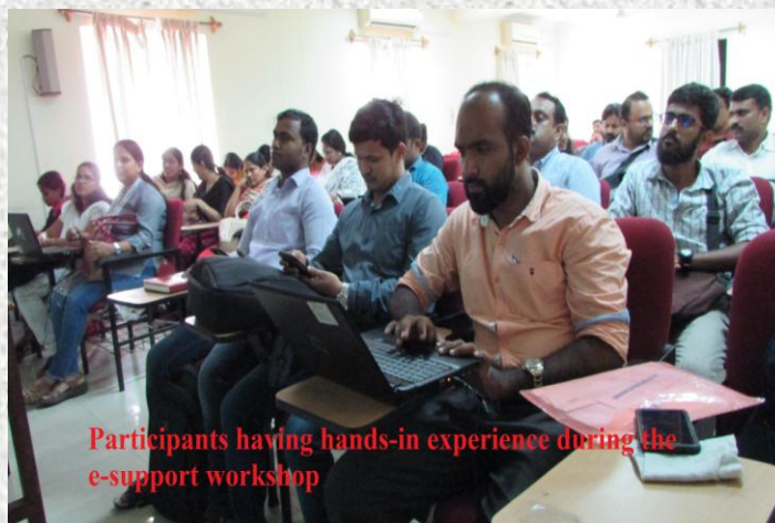
Participants having hands-on experience during the e-support workshop