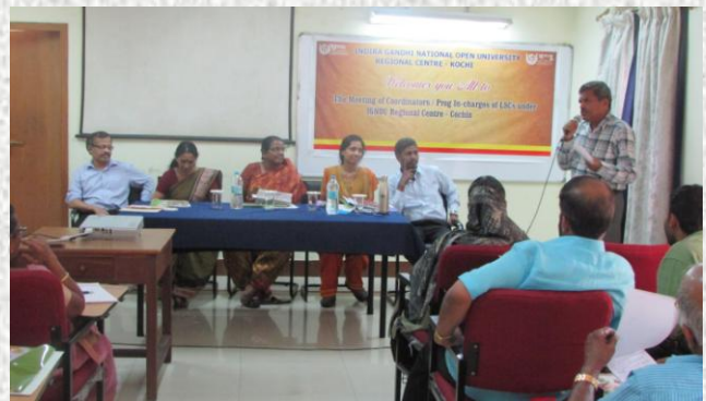
Reflections from Coordinator of SC 1407