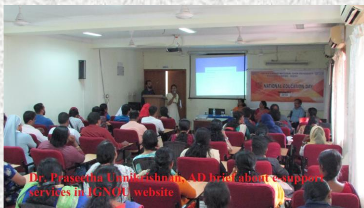
Workshop on e-support services of IGNOU in progress held on 11 th November, 2019