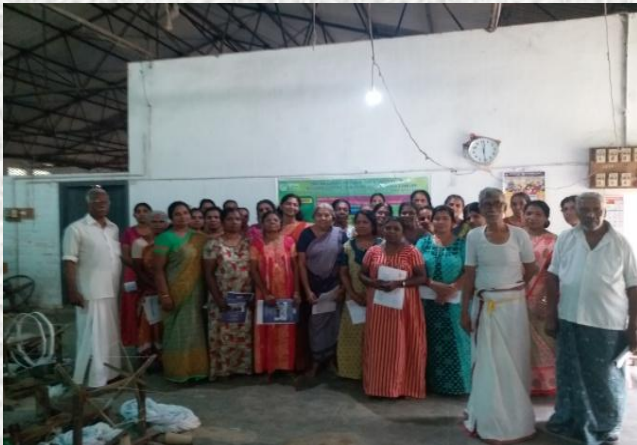
IGNOU Awareness programmes under UBA conducted for Weavers of Handloom Society at Chendamangalam on 20.12.2018