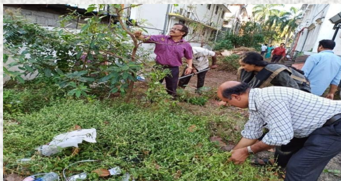
Staff of Regional Centre, Cochin cleaning the waste around existing saplings as a part of Plantation of Saplings on 17.01.2020