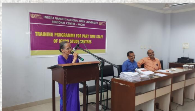
Self introduction by participants during the Orientation Programme for Part-Time Staff on 28.02.2020