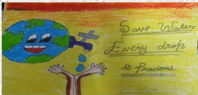
Drawing by a participant for Drawing and Slogan competition on the theme of 'Water conservation' conducted at Regional Centre, Cochin on 22.01.2020