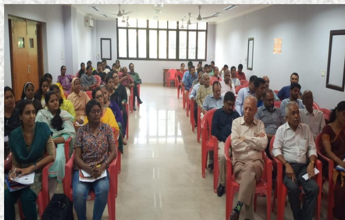
Participants of Panel Discussion on 'The Eat Right Movement' of Food Safety & Standards Authority of India (FSSAI) at IGNOU Regional Centre, Cochin on 07.03.2020