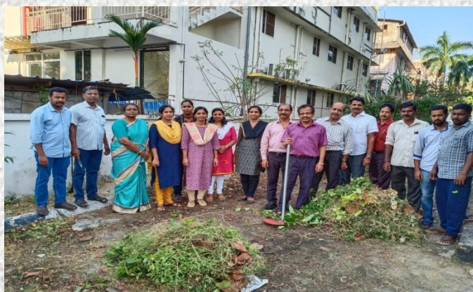
Staff of Regional Centre, Cochin during the Campus cleaning drive on 17.01.2020