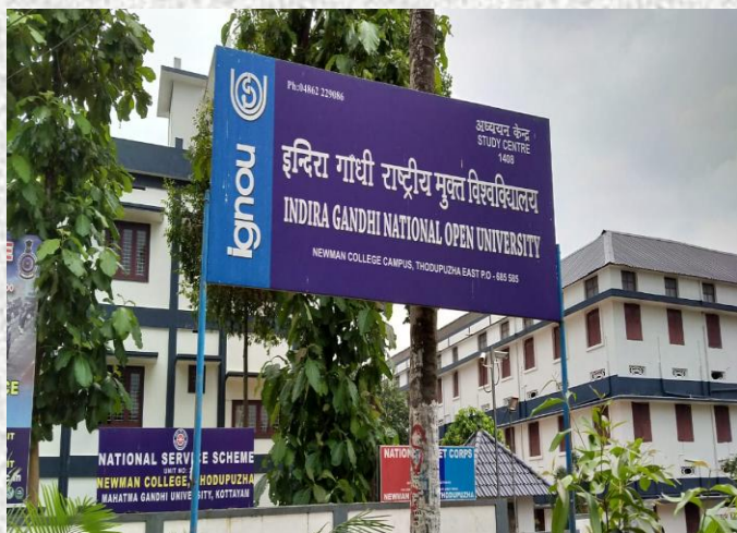
IGNOU Study Centre SC 1408 at Newman College, Thodupuzha.

IGNOU Study Centre SC 1408 is functioning from the campus of Newman College, Thodupuzha. It is a Regular Study Centre established under Regional Centre Cochin in the year 1991 with 91 students and has presently grown to 334 IGNOU students as on January, 2020. There are 21 IGNOU programmes activated at this Study centre which include various Masters, Bachelors, Post Graduate Diploma, Diploma and Certificate level programmes.