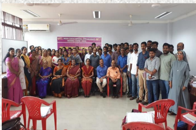
Participants along with Staff of Regional Centre, Cochin during the Orientation Programme for Part-Time Staff on 28.02.2020