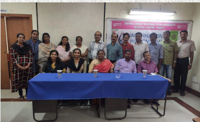
Staff of Regional Centre, Cochin during the Women's Day Celebration at the Regional Centre, Cochin on 05.03.2020

The International Women's Day was celebrated at Regional Centre Cochin on 5th March 2020.