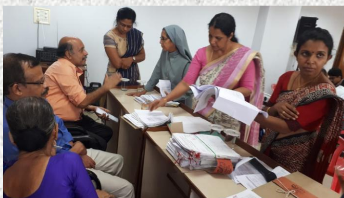
Hands on Experience on preparing of bills of counselling sessions by participants during the Orientation Programme for Part-Time Staff on 28.02.2020