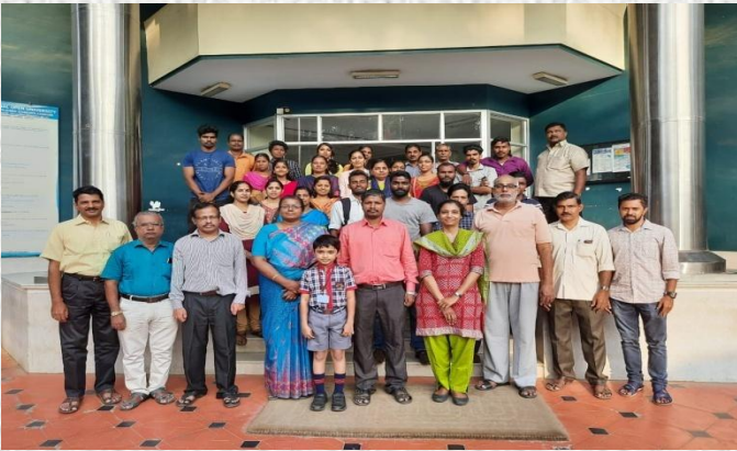
Staff of Regional Centre and Regional Evaluation Centre, Cochin during the Republic Day Celebrations at Regional Centre, Cochin on 26.01.2020