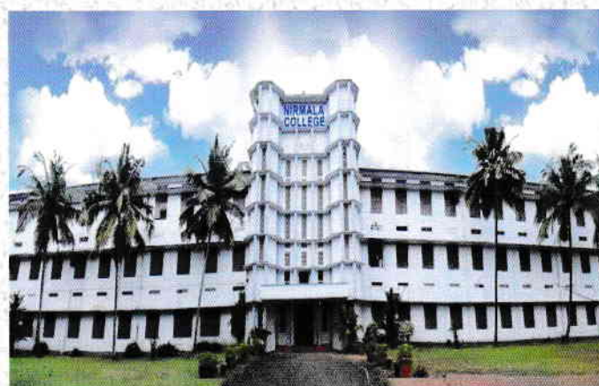
Entrance of Nirmala College, Muvattupuzha