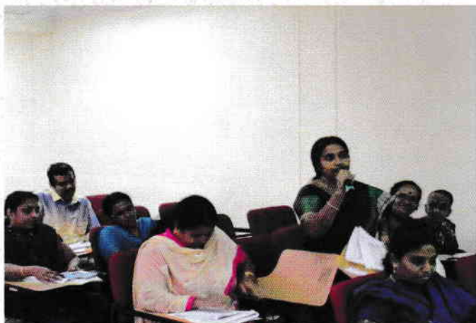
Discussion by participant in progress under CBCS Orientation Programmes for Part-Time Staff on 16.05.2019