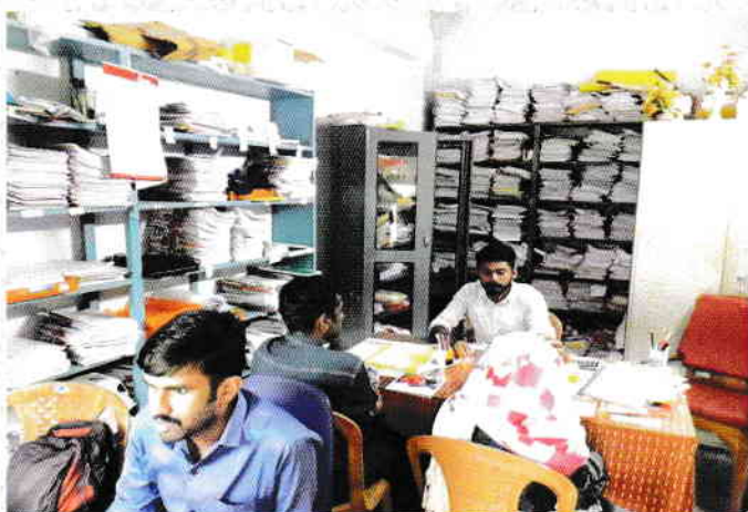
IGNOU staff of SC 14127 interacting with students at Office in Nirmala College, Muvattupuzha.