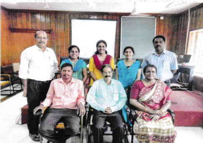
ECP Workshop Participants of PGDHE programme with the Regional Centre Officials and Workshop Director