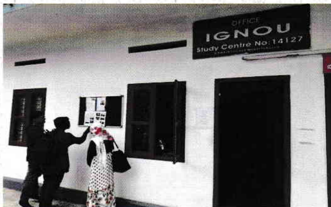
Students at the Entrance of IGNOU Study centre SC 14127 at Nirmala College, Muvattupuzha.

addition, the college is accorded the star college status in 2017 by the Dept. of Bio-Technology, Govt. of India, in recognition of the advancements made by the science departments of the college in scientific research.