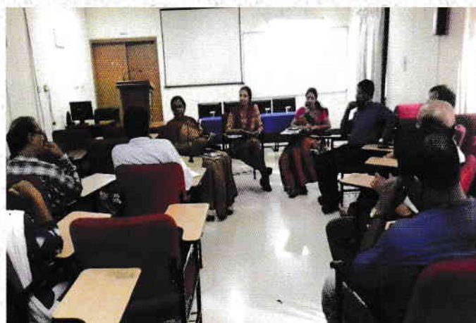
Brainstorming session in progress at Regional Centre Cochin for promotion of IGNOU programmes on 30.05.2019