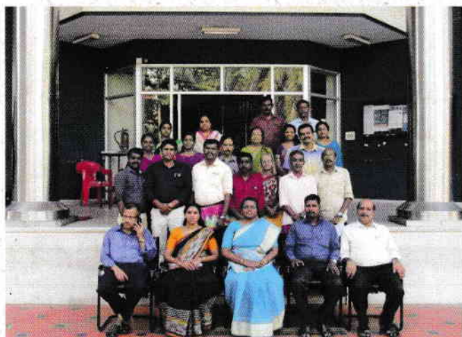
Participants at the CBCS Orientation Programme for Part-Time Staff on 16.05.2019