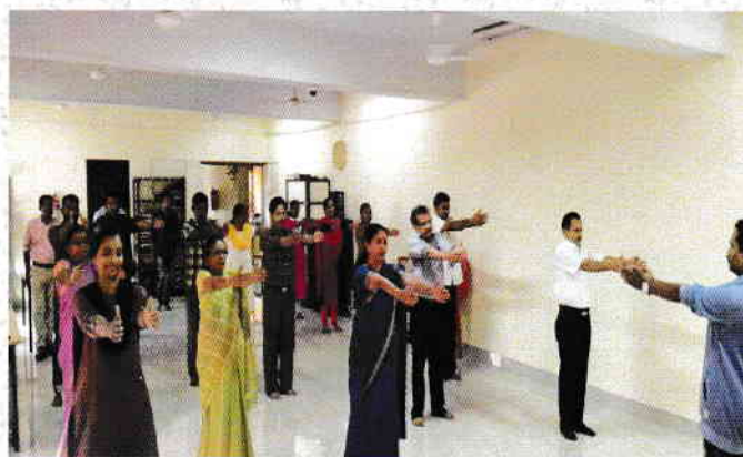
Hands on Experience of Yoga during Yoga day celebrations at Regional Centre Cochin on 21.06.2019.