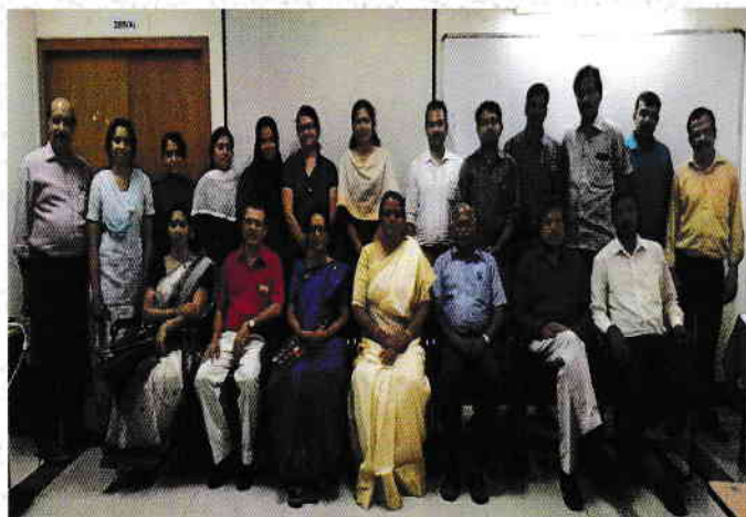
Regional Centre Staff alongwith all Exam Centres Superintendent on the meeting held on 29.05.2019