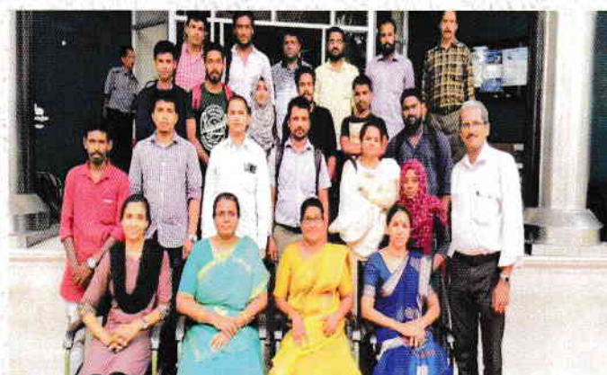
The participants of the Enrichment Session with the Resource Person and Regional Centre Staff on 21.06.2019