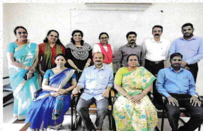
ECP Workshop Participants of PGDSLM programme with the Regional Centre Officials and Programme Director